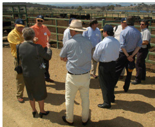
The Chilean Government and industry delegation take a look at research underway at the Beef CRC research facility 'Tullimba'.